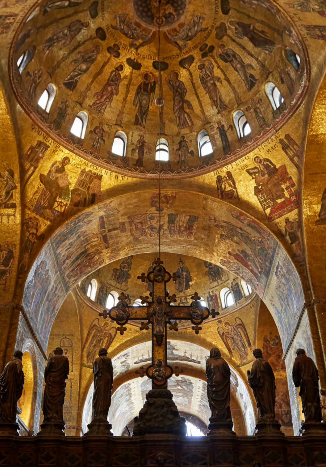
The sanctuary of the Basilica di San Marco, Venice, where Monteverdi served from 1613 until his death in 1643.